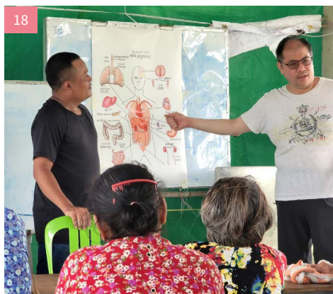
18 / 中國基督教播道會尖福堂短宣隊為村民舉辦健康講座。The mission team of E.F.C.C. Tsim Fook Church organized a health talk for the villagers.