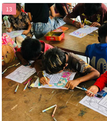
13 / 鄉村的孩子很認真地學習英文呢！The children in the village are studying English very diligently!