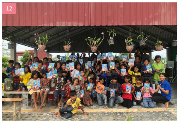
12 / 收到禮物，鄉村的孩子感到十分興奮。The children in village were very excited when receiving the gifts.