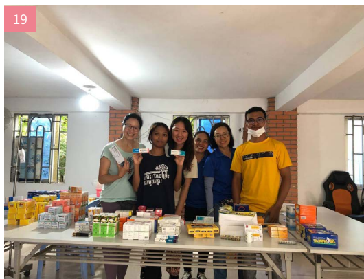
19-20 / 中國基督教播道會尖福堂醫療短宣隊不但為村民義診，更關心他們的需要。The medical mission team of E.F.C.C. Tsim Fook Church not only provided medical consultations for the villagers but also cared about their needs.