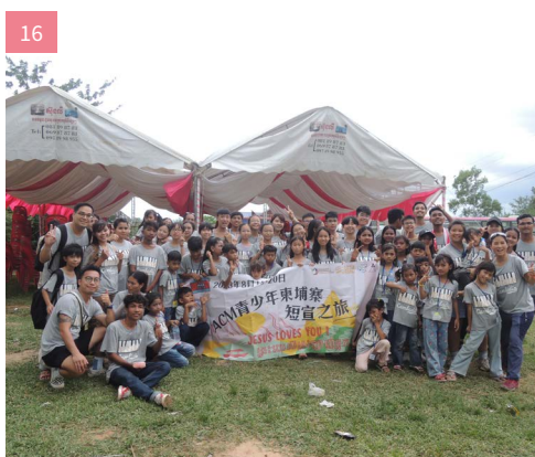
15-17 / 香港基督徒音樂事工協會一班青年人與窩匠中心孩子透過音樂向村民傳福音。The youth from HKACM and the children from our centre shared the good news with the villagers through the music.