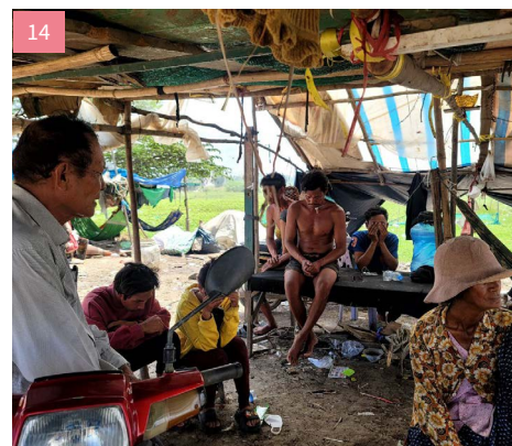
14 / 同工們每星期都到貧民區教導村民聖經。Our co-workers teach the bible to the people in the slum area every week.