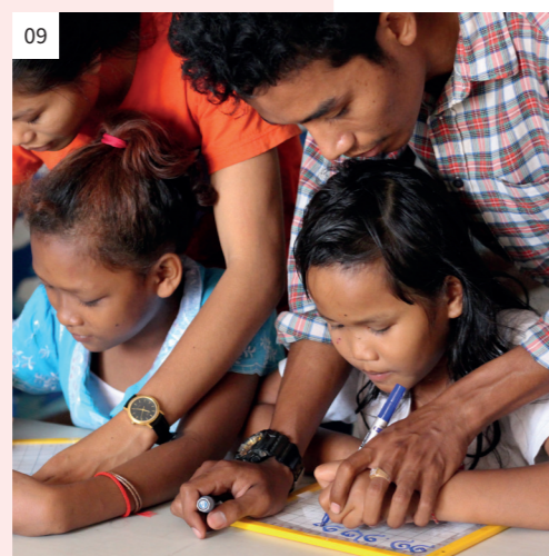
01-09 / 音樂、足球運動、烹飪等能幫助孩子發揮創造力。窩匠的學生很喜歡到中心學習，除了可以學習柬文、英文及數學外，亦可學習樂器、烹飪及踢足球。 Music, soccer, cookery, etc. can bring out the creativity of our children. They all enjoy coming to Metta because they can not only learn Khmer, English and Mathematics, but also musical instruments, cooking and how to play soccer.