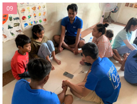
09 / 中心老師及孩子一同禱告。The teacher and kids prayed together.