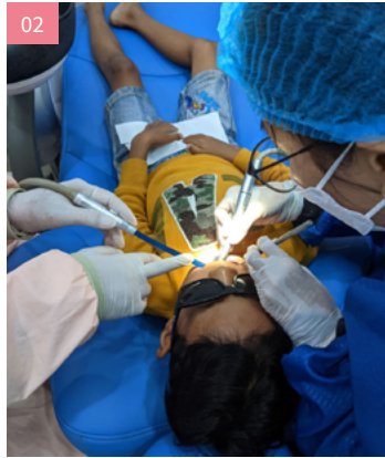
02 / 我們帶孩子去檢查牙齒。We brought the kids to the dentists.