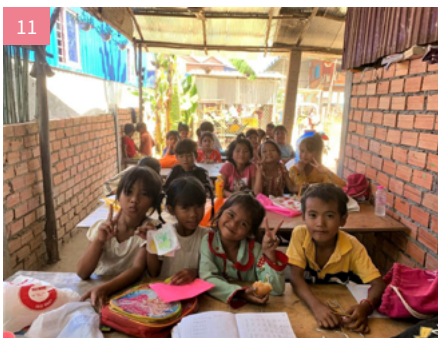
11 / 鄉村孩子很享受學習。The kids in village enjoyed studying very much.