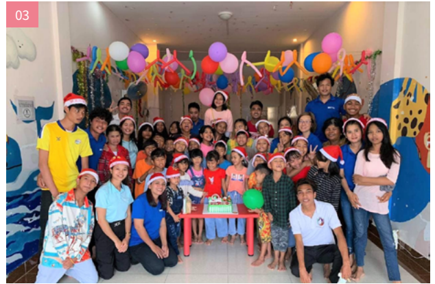
03 / 一年一度的聖誕活動，孩子們都十分興奮。The kids were very excited in the yearly Christmas activity.