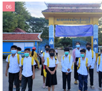
06 / 柬埔寨疫情漸趨穩定，孩子們終於可以實體上學了。The children can finally go to school as the pandemic relieved in Cambodia.