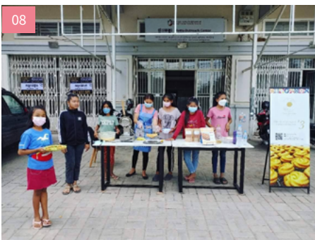
08 / 中心孩子協助售賣曲奇。The kids at centre helped to sell the cookies.