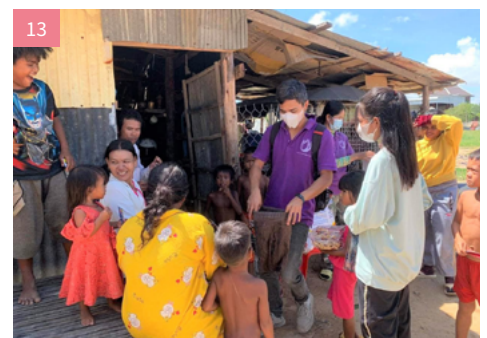
13 / 同工探訪村民，關心他們的近況。Co-workers visited the villagers and cared about their situation.