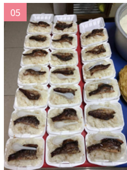
05 / 我們預備飯盒給街上生活的孩子。We prepared lunch boxes for the kids on the street.