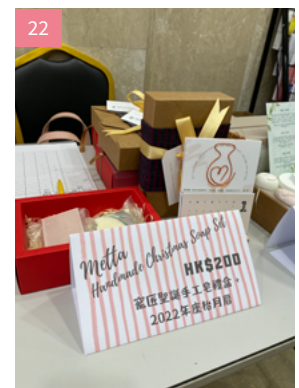
20-22 / 感恩有機會到中華基督教會香港閩南堂北角堂及跑馬地堂分享事工，以及義賣柬埔寨婦女的手工藝品。We were glad to share our ministry and sell the handmade products made by Cambodian ladies at CCC - Man Lam Christian Church, North Point and CCC - Man Lam Christian Church, Happy Valley.