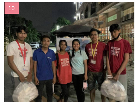
10 / 我們夜間也有探訪活動。We have night visits.