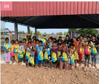
04 / 我們派發文具給鄉村的孩子。We distributed the stationeries to the children in village.