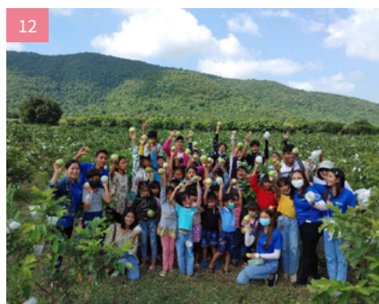
12 / 中心孩子一起到郊外遊玩，還摘下生果，滿載而歸。The kids at centre went outing and picked fruits joyfully.