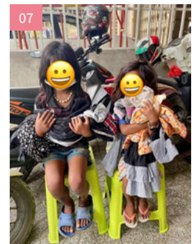
07 / 孩子們收到我們送出的衣服，露出滿足的笑容。The kids were very happy to receive the clothes given to them.