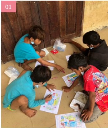
01 / 街上的孩子用心地填色，學習聖經故事。Children on the street colored the exercise and learned Bible stories intently.